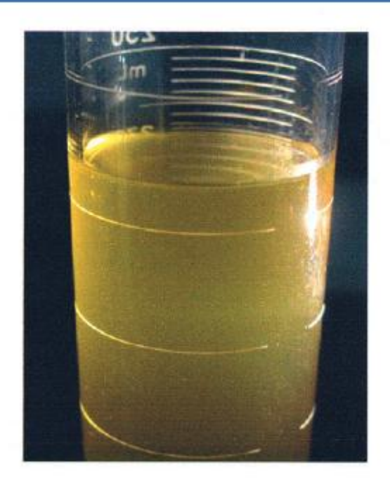
Figure 2: SAG 1572 silicone antifoam emulsion at 0.3% use level in a non-ionic spray adjuvant formulation.