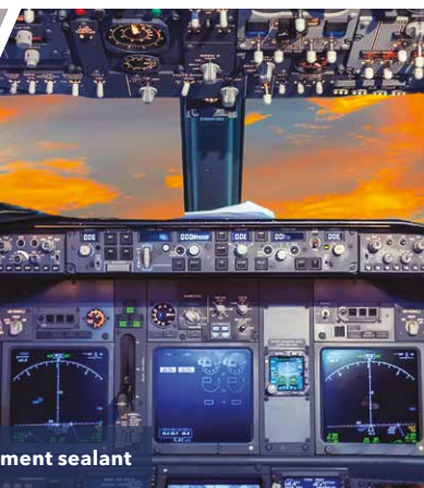
Cockpit instrument sealant