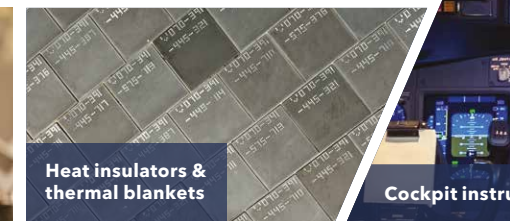
Heat insulators & thermal blankets