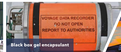
Black box gel encapsulant