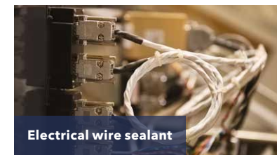
Electrical wire sealant