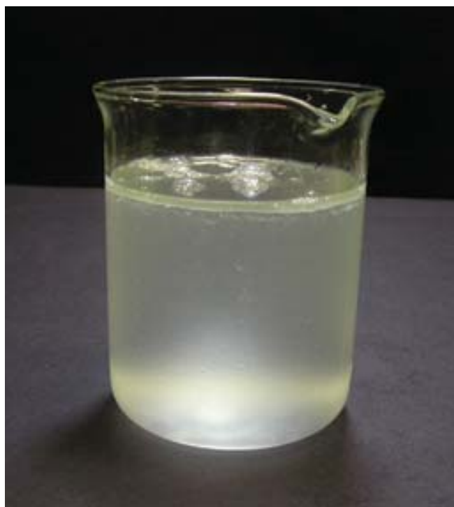
1% Conventional aminosilicone emulsion after boiling at 100°C, pH:12.