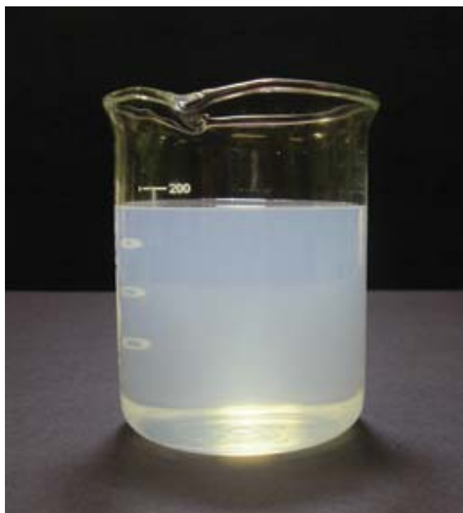
1% Magnasoft JSS hydrophilic textile enhancer water solution after boiling at 100°C, pH:12

(a) Biocides must be used in accordance with FIFRA regulations and manufacturer's label directions.