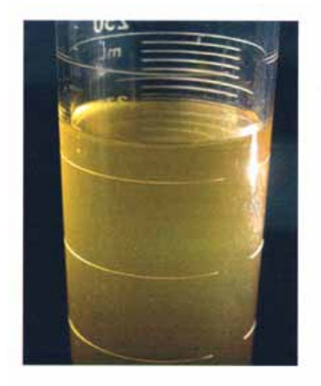
Figure 2: SAG 1572 silicone antifoam emulsion at 0.3% use level in a nonionic spray adjuvant formulation.

Effective dispersibility in agrochemical formulations is an issue with conventional foam control agents. However, the SAG 1572 silicone antifoam emulsion offers much improved compatibility with many adjuvants and "In-can" pesticide formulations. Figure 2 illustrates the dispersion stability of SAG 1572 silicone antifoam emulsion in a typical nonionic surfactant based adjuvant system. In this example, SAG 1572 silicone antifoam emulsion remains homogeneously dispersed for greater than two months, while typical foam control agents show significant signs of separation after a few days.