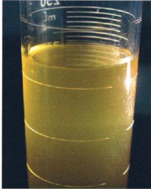
Figure 2: SAG 1572 silicone antifoam emulsion at 0.3% use level in a non-ionic spray adjuvant formulation.