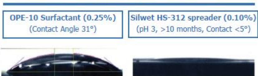
Figure 1: Contact Angles of Spreader Adjuvants

Because the Silwet HS-312 spreader has very low surface tension, the contact angle of spray solutions on leaf surfaces is reduced compared to other surfactant adjuvants. This important property is shown in Figure 1 below, which illustrates Silwet HS-312 spreader having less than 5° contact angle relative to the Octylphenol Ethoxylate containing 10 EO units (OPE-10), having a 31° contact angle. It is also important to note that the lower Silwet HS-312 spreader contact angle is achieved at much lower concentrations compared to the OPE-10 surfactant concentration.