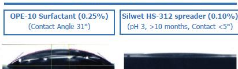
Figure 1: Contact Angles of Spreader Adjuvants

Because the Silwet HS-312 spreader has very low surface tension, the contact angle of spray solutions on leaf surfaces is reduced compared to other surfactant adjuvants. This important property is shown in Figure 1 below, which illustrates Silwet HS-312 spreader having less than 5° contact angle relative to the Octylphenol Ethoxylate containing 10 EO units (OPE-10), having a 31° contact angle. It is also important to note that the lower Silwet HS-312 spreader contact angle is achieved at much lower concentrations compared to the OPE-10 surfactant concentration.